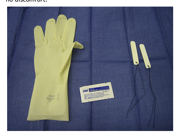
Figure 1 A standard, sterile, size 8 latex gloves, KY jelly and Merocel packs used for nasal packing.

A standard, sterile, size 8 latex gloves has the index and middle fingers cut off en bloc as shown (Figure 1). Merocel packs are introduced into each finger (Figure 2). The outsides of the glove fingers are smeared generously with KY Jelly and the packing inserted into the nasal cavity. Using a syringe and a blunt drawing-up needle, the Merocel packs are then moistened within their fingers causing expansion and tamponade. The bridge of latex between the fingers acts as a safety preventing intranasal migration of the packing, but this can be further reinforced by the traditional tying of the strings of the Merocel packs (Figure 3). At time of removal, there is little or no crusting of dried blood to the packing assembly and the whole unit can usually be slid out of the patients' nose with virtually no discomfort.