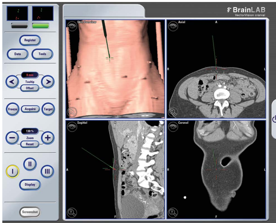
Figure 1. Stereotactic image-guided navigation of a computed tomography angiogram (CTA) of the abdominal wall vasculature, with three-dimensional reconstructed images shown on BrainLAB Vector Vision Cranial ® software, demonstrating coronal, sagittal and axial planes of a localized deep inferior epigastric artery (DIEA) perforator. [Color figure can be viewed in the online issue, which is available at wileyonlinelibrary.com .]

MRA in perforator mapping, 28–30 while others have found no benefit over other modalities. 31 The main benefit of MRA is its lack of ionizing radiation, and while there is certainly less interobserver variability, expense and availability are limiting factors, as is the current resolution able to be achieved when compared to CTA.